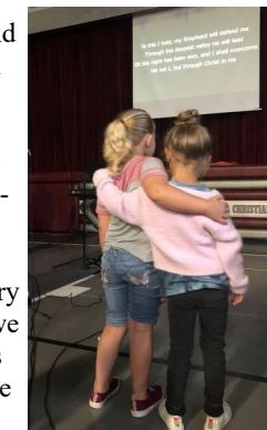
Elementary friends praising God in the first Chapel of the year.

ers because we would have completely full classes in preschool and prekindergarten and at the same time need to a second kindergarten and 1 st grade class. Praise God!! The elementary grew the most, but we did see new students come join our middle and high school classes. Remember I said the average number of new students has been 56 since 2013? Well, for the 2021-2022 school year God has brought in 124 new students!! To start the year we have 324 students on campus. Praise God!! God’s hand is on us and our campus is full – never “Freak Out.”