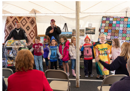
Class Baskets Continue to be a favorite event

The Auction on Saturday, October 16 will begin at 9 am and run until about 11 am. It will once again be held outdoors, under a tent, in the back parking lot. Coffee, apple dumplings and other breakfast type items will be for sale. The live Auction will feature selections of favorite items, experiences and a few homemade quilts. Class baskets will be auctioned, beginning at 9:30 am. Also featured the past several years is an Online Auction